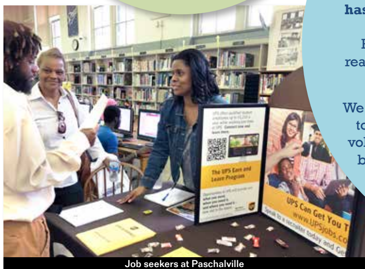
Job seekers at Paschalville

We doubled the number of classes for adult learners to eight in the community and trained seven new volunteers to tutor them. Thanks to this tremendous boost in service capacity in the community, 66% of assessed adult learners have gone on to enroll in a course in the community or online.