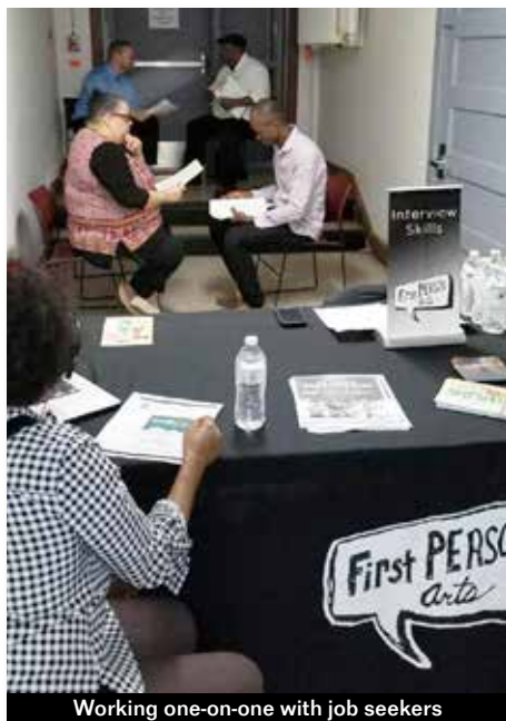
Working one-on-one with job seekers