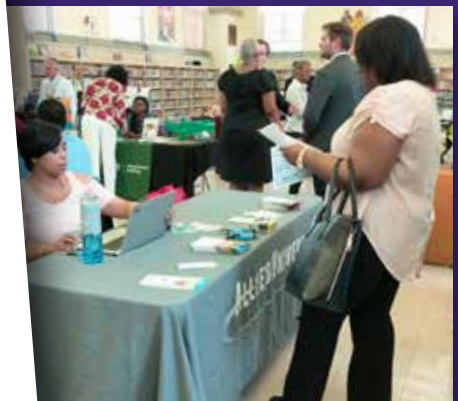
Spring Job Fair at Paschalville