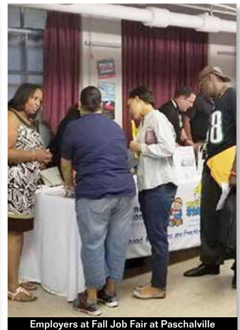
Employers at Fall Job Fair at Paschalville