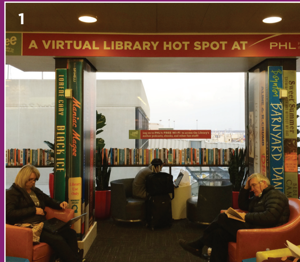
1. The Free Library's Hot Spot at the Philadelphia International Airport welcomes travelers with comfy furniture and special access to our renowned digital collections, author podcasts, and more.

The 10th annual Field Family Teen Author Series hosted 3,070 students for 15 engaging teen programs throughout the Free Library system. The Field Family Teen Author Series promotes a lifelong love of reading by creating a personal connection between authors and students in grades 7-12, and each student receives a signed book to take home. For many participating students, this is the first book they have ever owned.