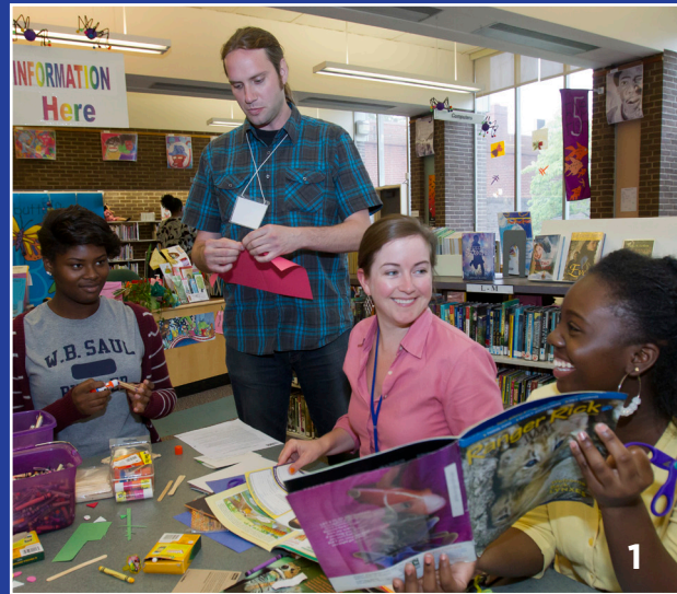
1. Students and Afterschool Leaders enjoy LEAP at Whitman Library.