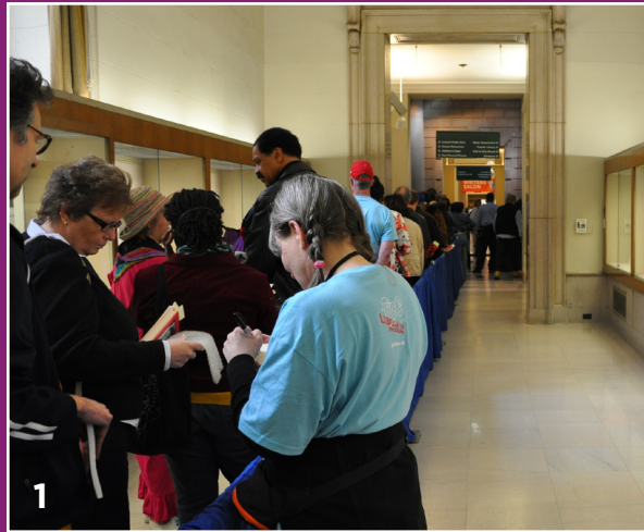
1. With about 100 author events each year that draw thousands of people to the Parkway Central Library, dedicated volunteers are absolutely essential to the success of the Free Library's award-winning Author Events Series.