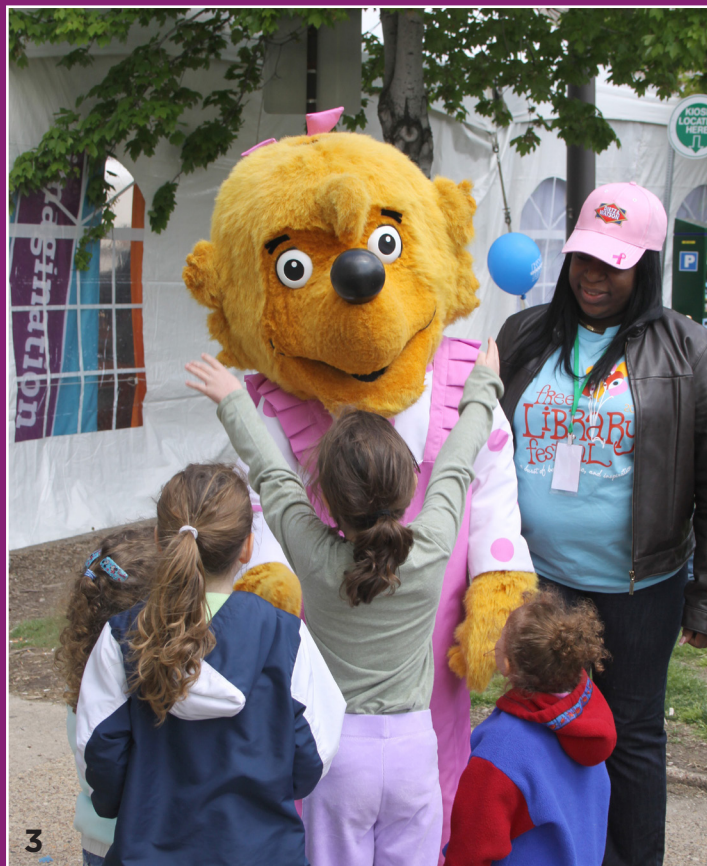
3. Free Library volunteers wear many hats—or should we say costumes? A volunteer, dressed as a Sister Bear from the Berenstain Bears, gets a big hug from a young attendee at the 2010 Free Library Festival.