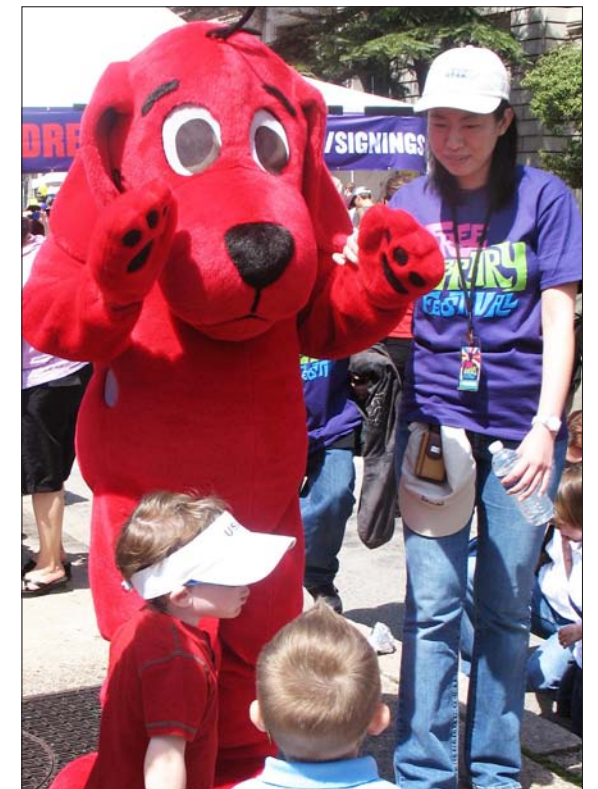
A volunteer introduces Clifford the Big Red Dog to children at the Free Library Festival.

Established in 1973, the Friends of the Free Library of Philadelphia is an independent, nonprofit organization whose mission is to support the Free Library. Through 50 affiliate neighborhood chapters, the organization boasts more than 10,000 members and promotes cooperation and communication between Philadelphia's communities and the Free Library. This year, the Friends led a successful effort to keep branch libraries from closing during the City's budget crisis.