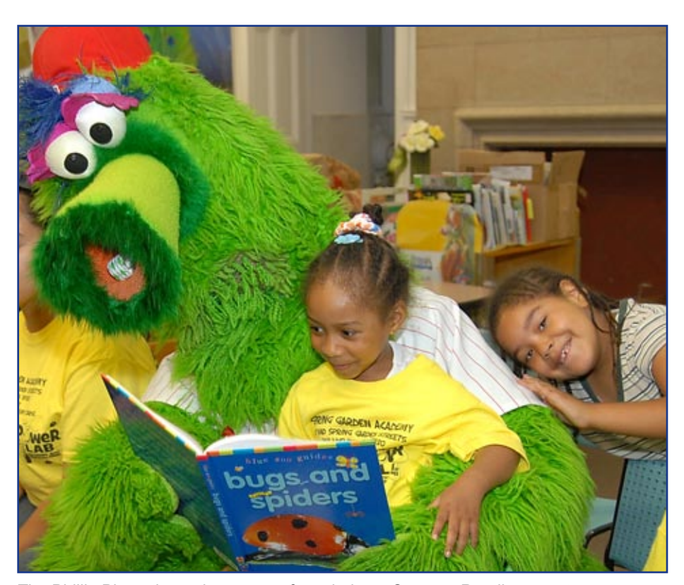
The Phillie Phanatic reads to young fans during a Summer Reading event.

The mission of the Free Library of Philadelphia Foundation is to develop resources in order to expand, enhance, and support the services, collections, building programs, and other activities of the Free Library of Philadelphia. Through its Board of Directors, the Foundation seeks resources from individuals, corporations, foundations, and other organizations. The Foundation also ensures efficient and appropriate expenditure of funds in keeping with the goals and mission of the Free Library, as well as the expressed wishes of donors.