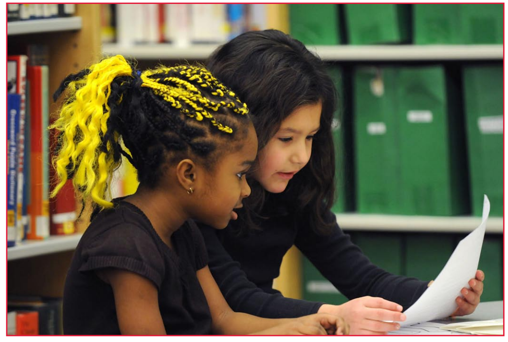
Two young girls study their artwork at Independence Branch.

During Catch the Reading Bug! at Kensington Branch , kids participated in hands on activities during Wagner Free Institute of Science programs. Using putty and Play-Doh, children recreated artifacts such as shark teeth, starfish, sponges, seashells, crab shells, and more.