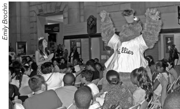
The Phillie Phanatic entertains groups of school children and Miss Philadelphia at the Summer Reading kickoff event.

The Library is committed to free, public access to a variety of resources, some of the most important of which are its popular programs. Over the past year, programs have grown in essential ways, reaching new audiences and enriching the Library community.